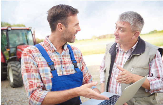
Farmers discuss agricultural policies and their implications.

The Farm Bill Analyzer Tool provides producers with an opportunity to compare potential risk protection from PLC and ARC. Farmers enter information about their farms, including historical yields, planted acres and anticipated yields. This information is combined with county history yield values and projected market prices and yields to offer guidance on which programs producers should select. This tool also included consideration of crop insurance policy options that might be available depending on the U.S. Department of Agriculture (USDA) program selected. Combined with the webinar and one-on-one producer meetings, the decision tool aided farm managers in selecting the best risk protection for their individual farms. This tool was downloaded for use 160 times.