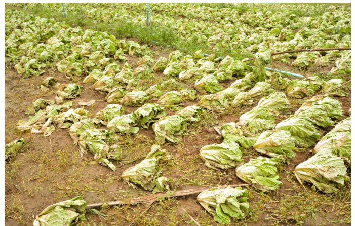
Agricultural land affected by flooding.

Articles highlighting additional insurance programs were also published. The animal agriculture team promoted awareness of the Micro Farm Program, a newly available insurance option for beekeepers. The farm management team drew attention to the Post-Application Coverage Endorsement program for field crop growers that sidedress nitrogen. These articles were picked up by various media and reached 68,333 readers.